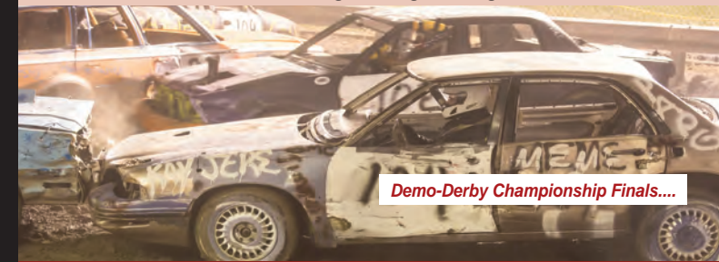
Demo-Derby Championship Finals....

WQLV 98.9 FM - "The Pulse Of Central PA" • MET & Associates One Stop Recycling • MH Heating & Cooling Hoffman Engineering & Design